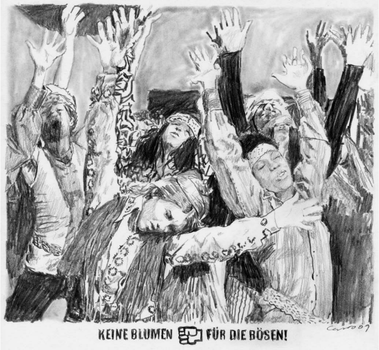
Diego Castro, Die Aura des Kunstwerks im Zeitalter der Reproduzierbarkeit der Aura, Zeichnung aus einer Serie von 50 / drawing out of a series of 50, 2009